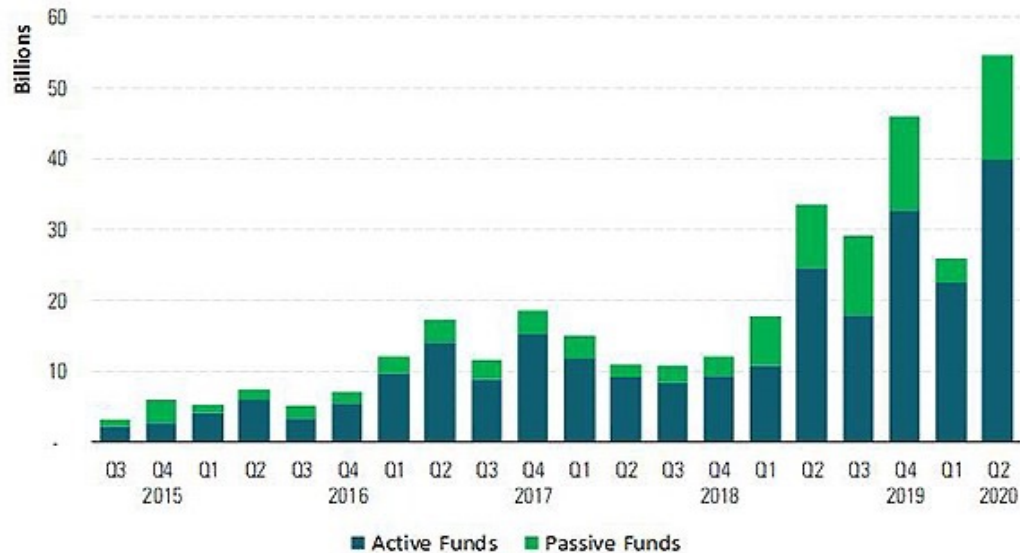
Exhibit 1 Quarterly European Sustainable Fund Flows (EUR Billion)

flowed into all U.S. stock and bond mutual funds last year.